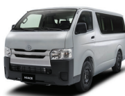
Silver Mica Metallic